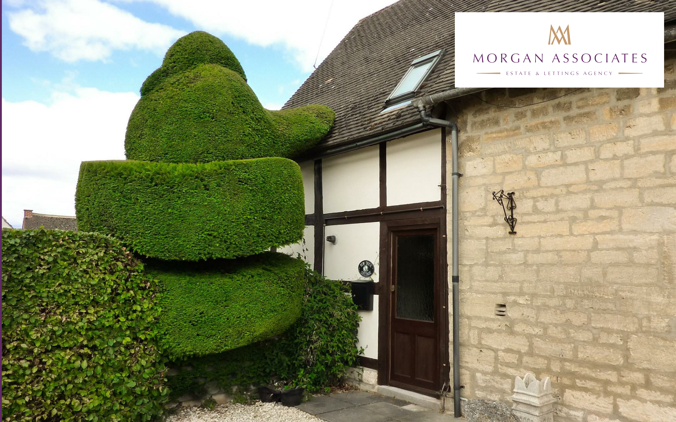
Yew Tree Cottage Home Farm, Mill Street GL52 3BG £1,050 PCM